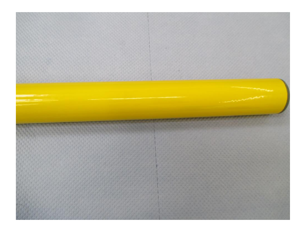
Fig 3: Photograph showing the condition of the 33.7 x 250mm Tube Sample after 216 hours Salt Spray Test