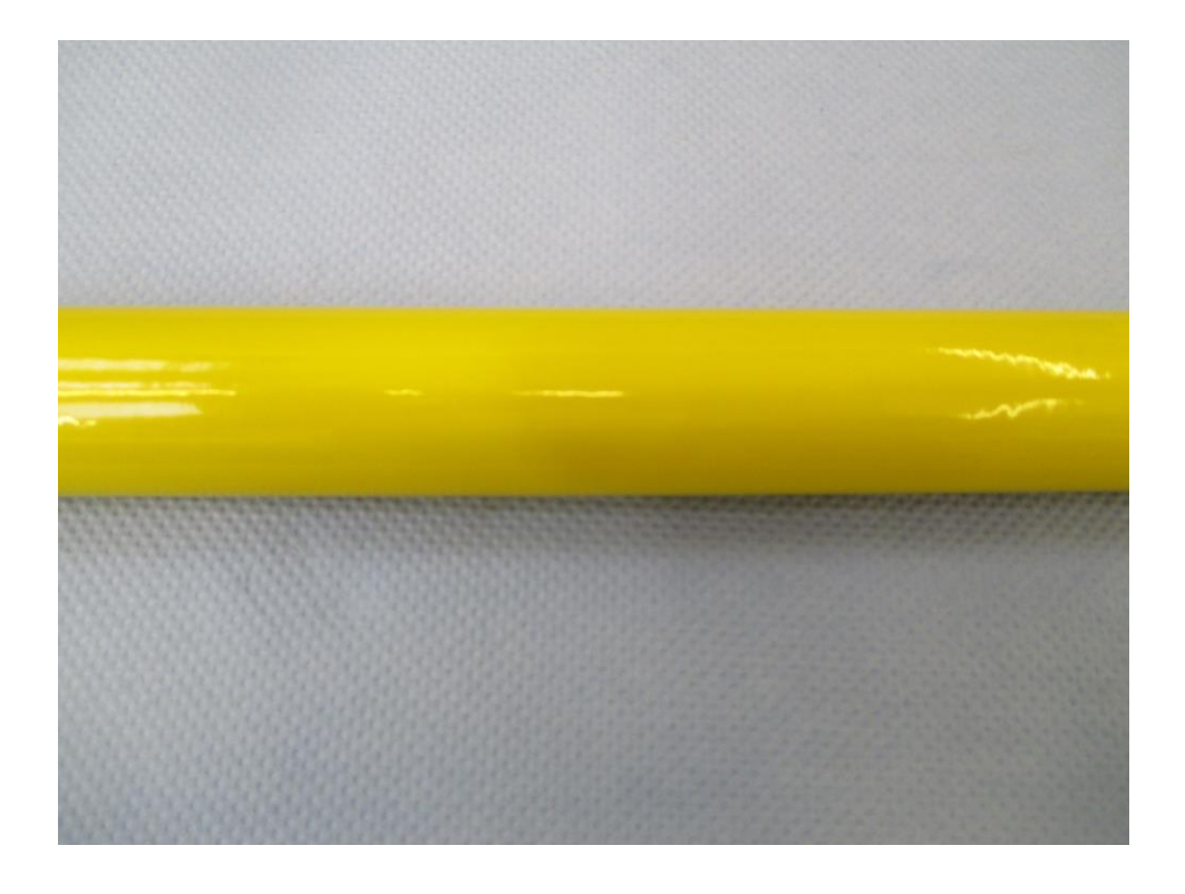
Fig 2: Photograph showing the condition of the 33.7 x 250mm Tube Sample