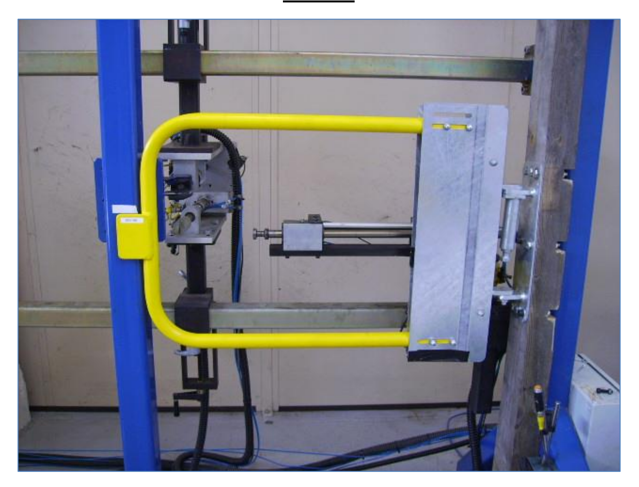
Sample mounted in rig and on test